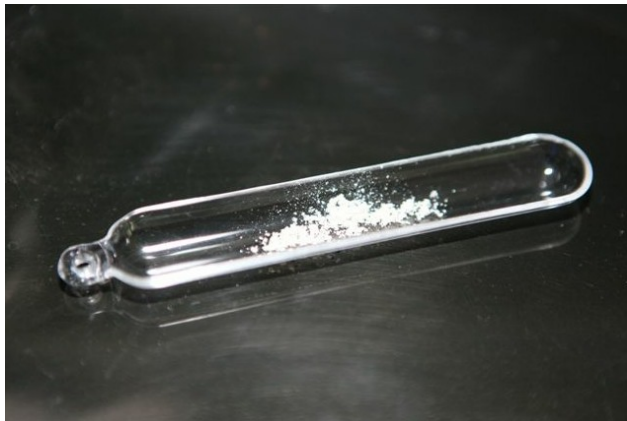
Appearance at visible light