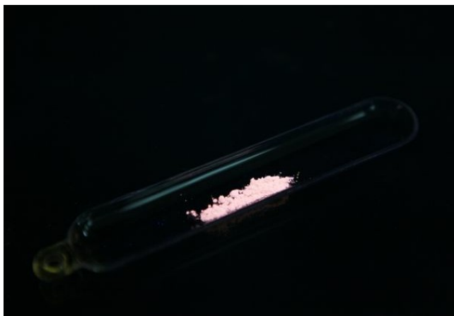
Excitation color at 366nm

All applications using this product should be thoroughly tested prior to approval for production.